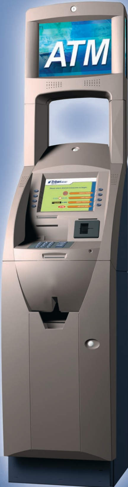
RL5000 with high topper

Triton's PC-based RL5000 is changing the way people think about ATMs. The all-new model offers a stunning 10.4-inch LCD display and supports a long list of value-added transactions. All at a much lower price point than other PC-based machines.